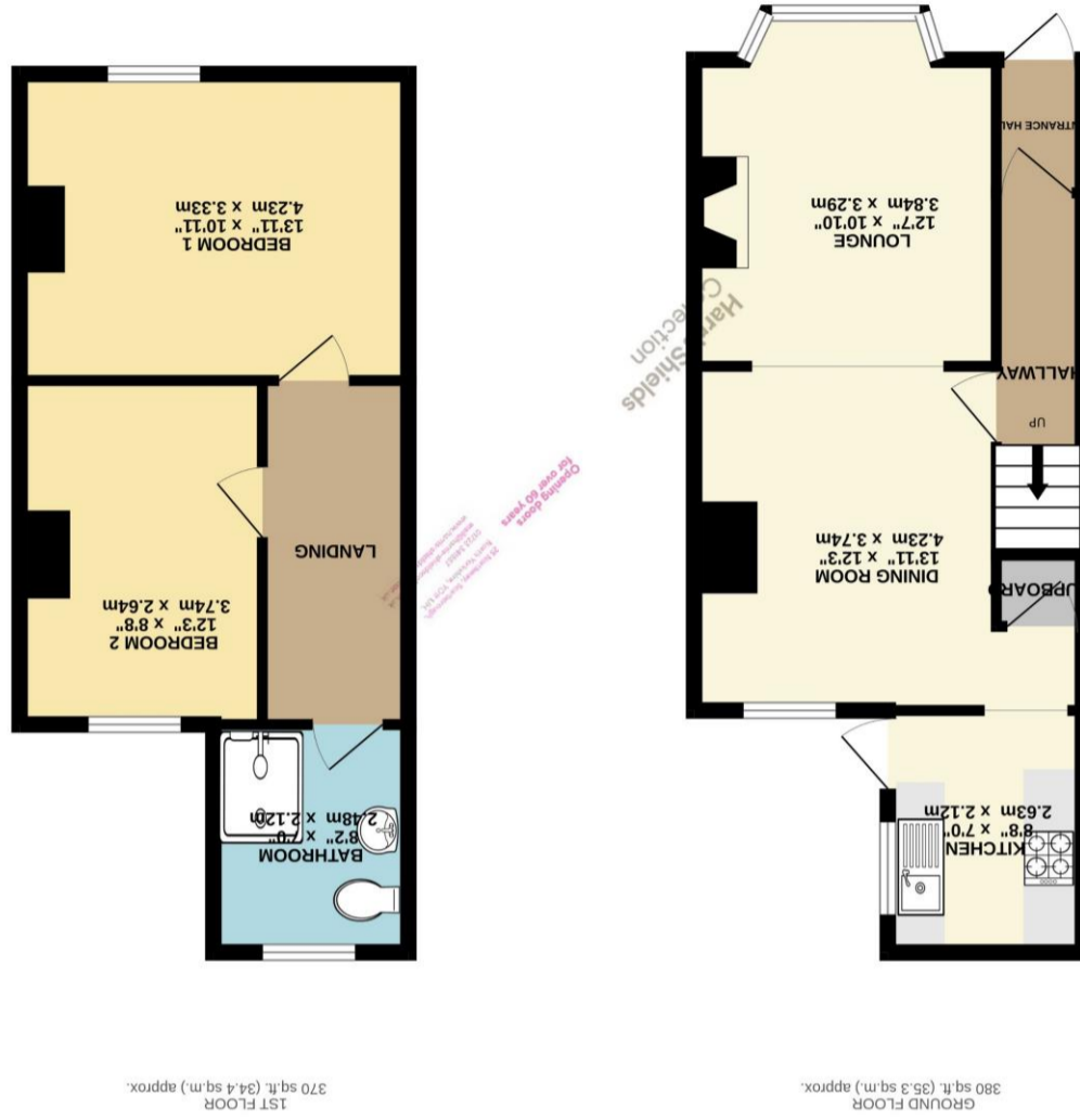
62 Hampton Road, Scarborough, North Yorkshire, YO12 5PX

When every attempt has been made to ensure the accuracy of the floorplan contained here, measurements of doors, windows, rooms and other items are approximate and no responsibility is taken for any inaccuracy or mis-statement. This plan is for guidance purposes only and should be used as such by any prospective purchaser. The services, systems and appliances shown have not been tested and no guarantee is made with respect to their operation or efficiency.